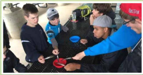
Middle School attended a field trip at Mountain Island State Forest.